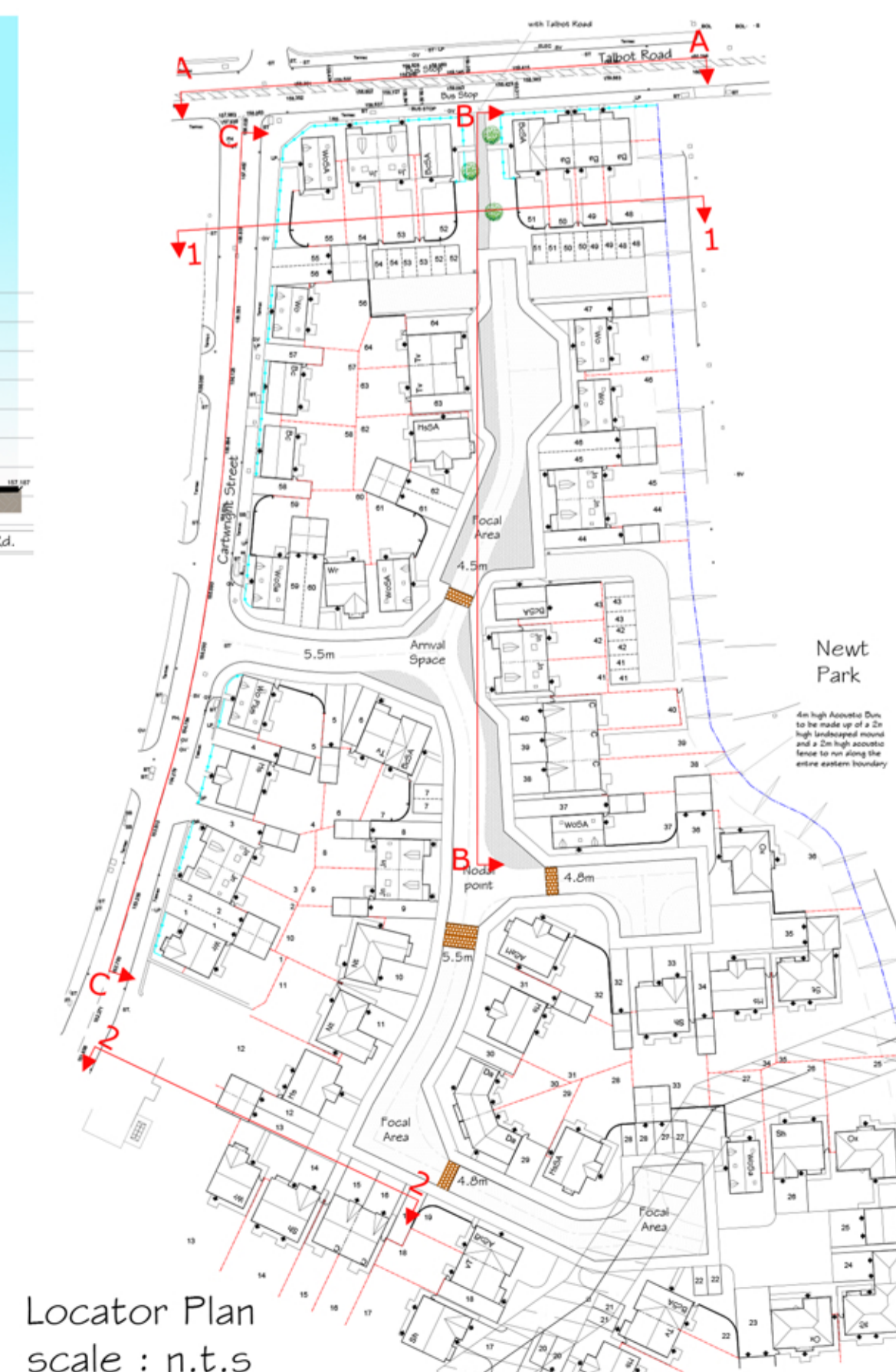
Locator Plan scale : n.t.s