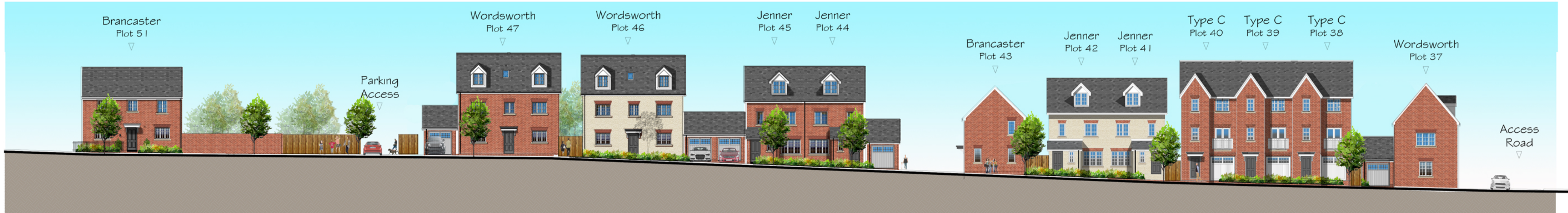
Street Scene B-B