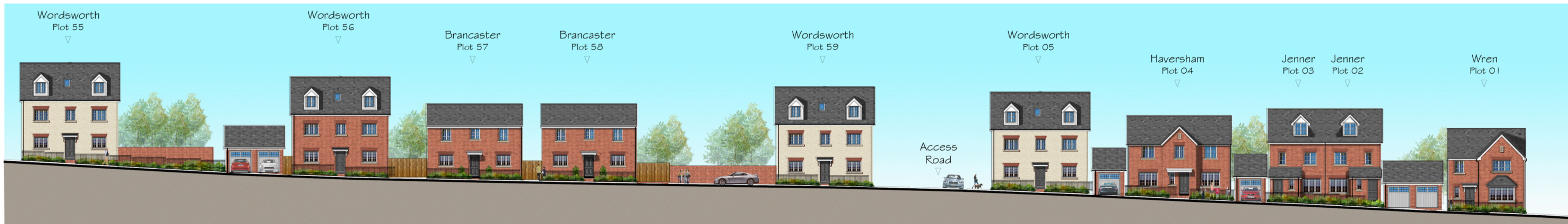
Street Scene C-C