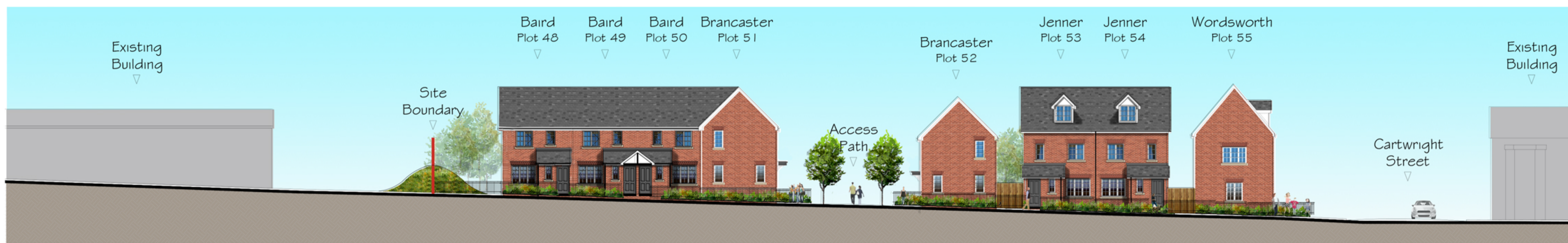
Street Scene A-A

This document and its associated intellectual assets remain the property of Baldwin Design Consultancy Ltd. and no element of such is to be used beyond the contracted usage.